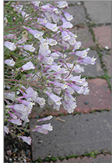
Dwarf Hairy Penstemon flowers