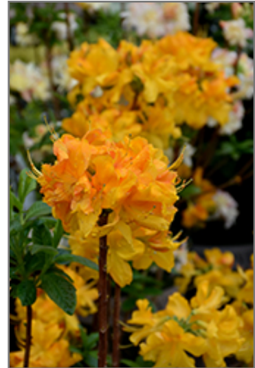
Klondyke Azalea flowers

Klondyke Azalea will grow to be about 8 feet tall at maturity, with a spread of 8 feet. It tends to be a little leggy, with a typical clearance of 1 foot from the ground, and is suitable for planting under power lines. It grows at a slow rate, and under ideal conditions can be expected to live for 40 years or more.