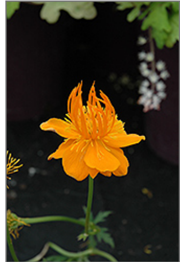
Superbus Globeflower flowers