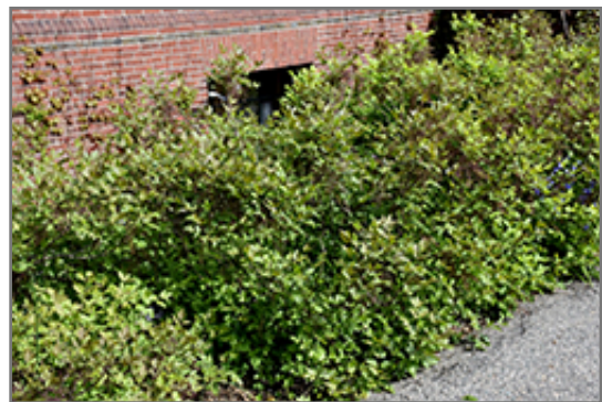
Shrub Yellowroot