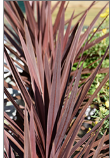
Red Star Red Grass Tree foliage