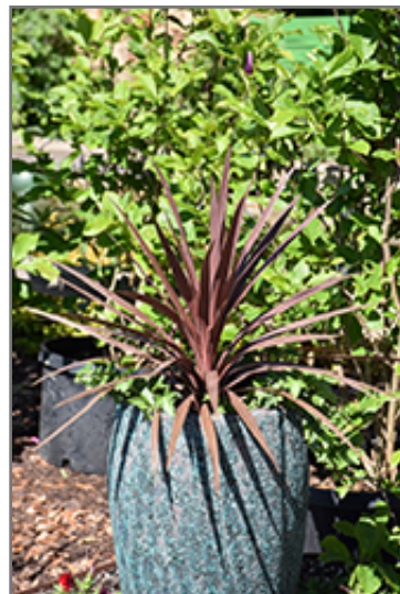
Red Star Red Grass Tree

Red Star Red Grass Tree is a fine choice for the yard, but it is also a good selection for planting in outdoor pots and containers. Its large size and upright habit of growth lend it for use as a solitary accent, or in a composition surrounded by smaller plants around the base and those that spill over the edges. It is even sizeable enough that it can be grown alone in a suitable container. Note that when growing plants in outdoor containers and baskets, they may require more frequent waterings than they would in the yard or garden.