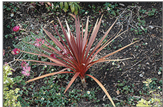
Red Star Red Grass Tree