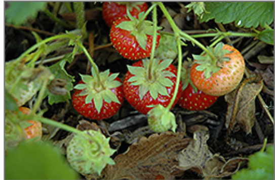
Common Wild Strawberry

Common Wild Strawberry features dainty white cup-shaped flowers with yellow eyes along the stems from late spring to early summer. Its attractive tomentose round compound leaves remain green in colour throughout the season. It features an abundance of magnificent cherry red berries from late spring to late summer.