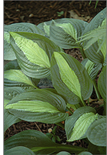
Kiwi Full Monty Hosta foliage