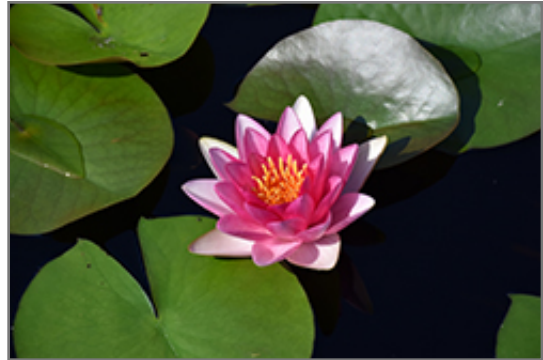
Attraction Hardy Water Lily flowers