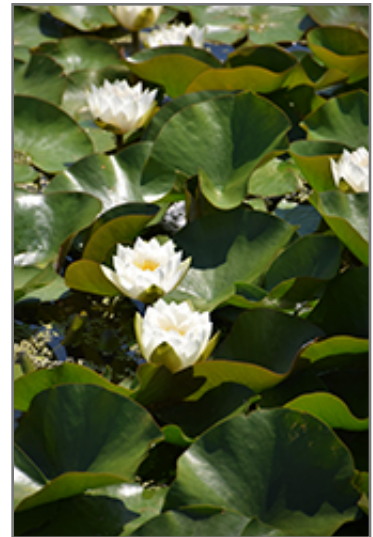
Virginalis Hardy Water Lily flowers