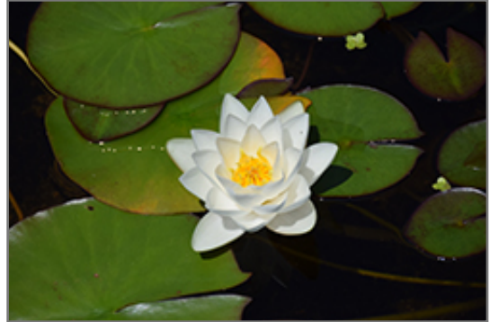
Virginalis Hardy Water Lily flowers