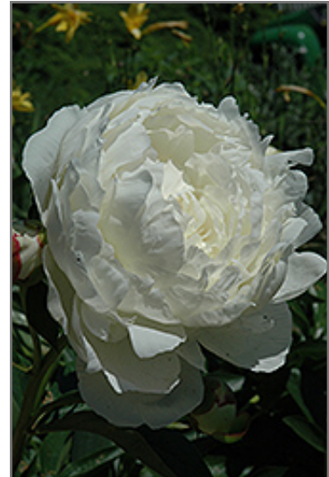
Elsa Sass Peony flowers