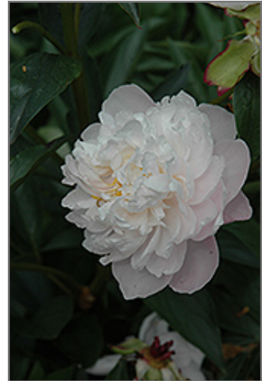
Lady Alexandra Duff Peony flowers