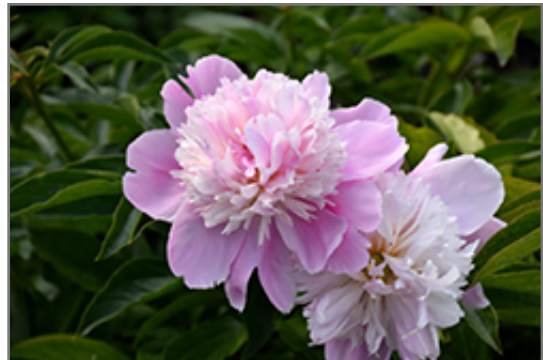
Monsieur Jules Elie Peony flowers