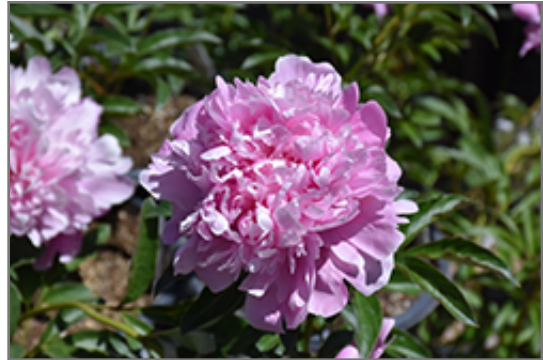
Monsieur Jules Elie Peony flowers