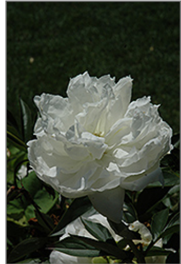
Mother's Choice Peony flowers