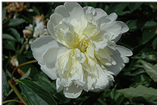
Primevere Peony flowers