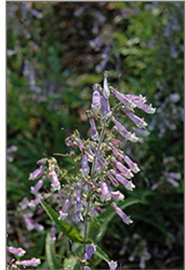
Hairy Beard Tongue flowers